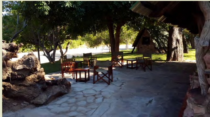
Deka – Lukosi Camp