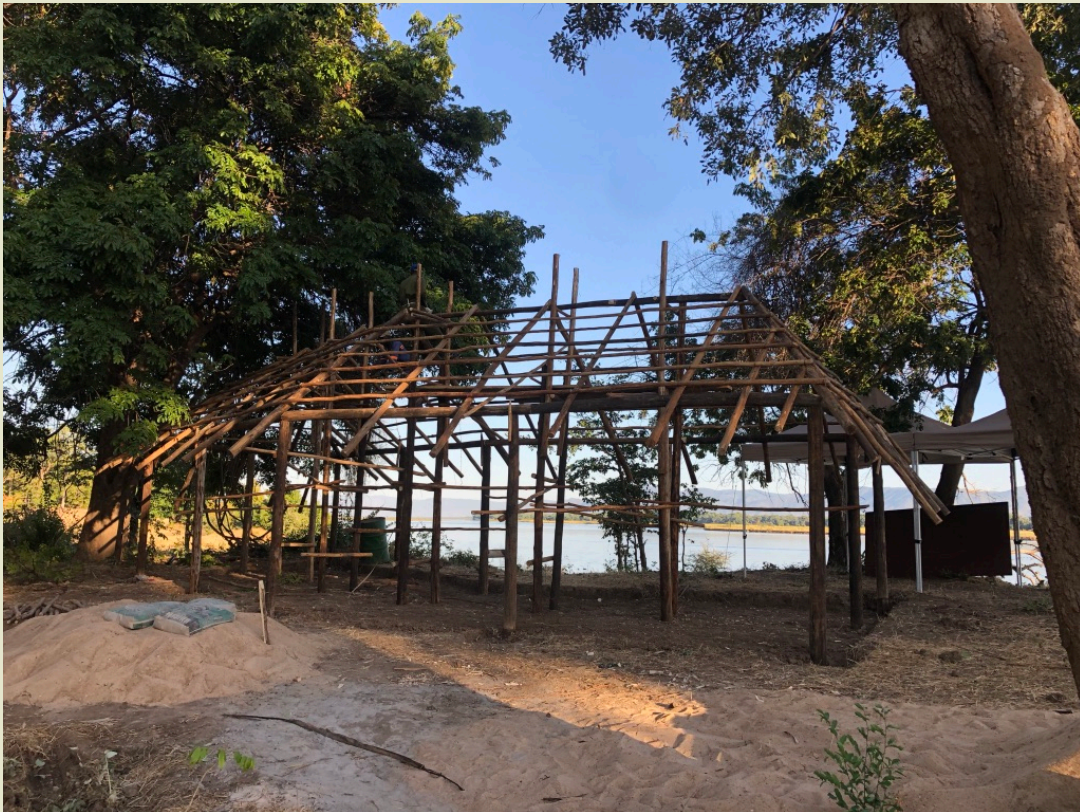
Chitembe River Lodge Under Construction

Despite all the negativity that Covid has brought, we like to take the positives out of it, in 2020 we built a new camp on the Zambezi River in Mana Pools called Chitembe River Lodge, we now offer our clients the chance to fish some of the best waters the Zambezi River has to offer, it's definitely worth taking a couple of extra days to visit.