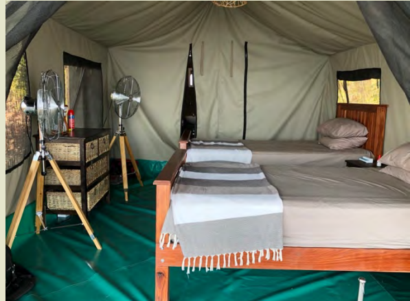
Chitembe River Lodge