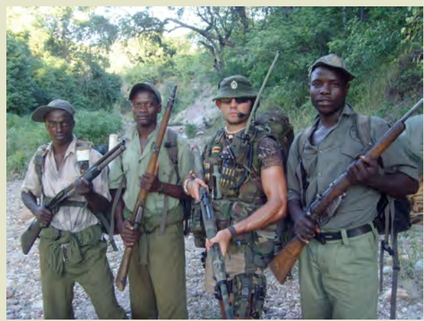
HHK Anti-Poaching Patrol Ready for Business