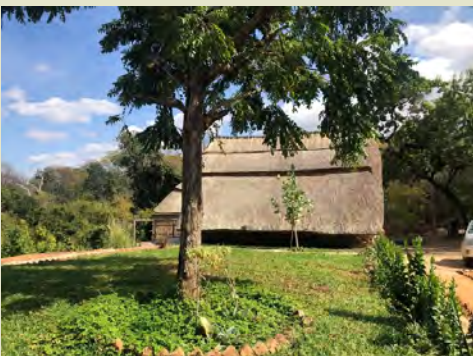
Mukwishi Angwa Camp