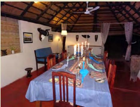
Dande Murara Camp

Together these two blocks make a continuous area in excess of half a million acres on which HHK has the exclusive rights.